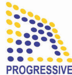
ISO/IEC 27701:2019 PRIVACY INFORMATION MANAGEMENT SYSTEM